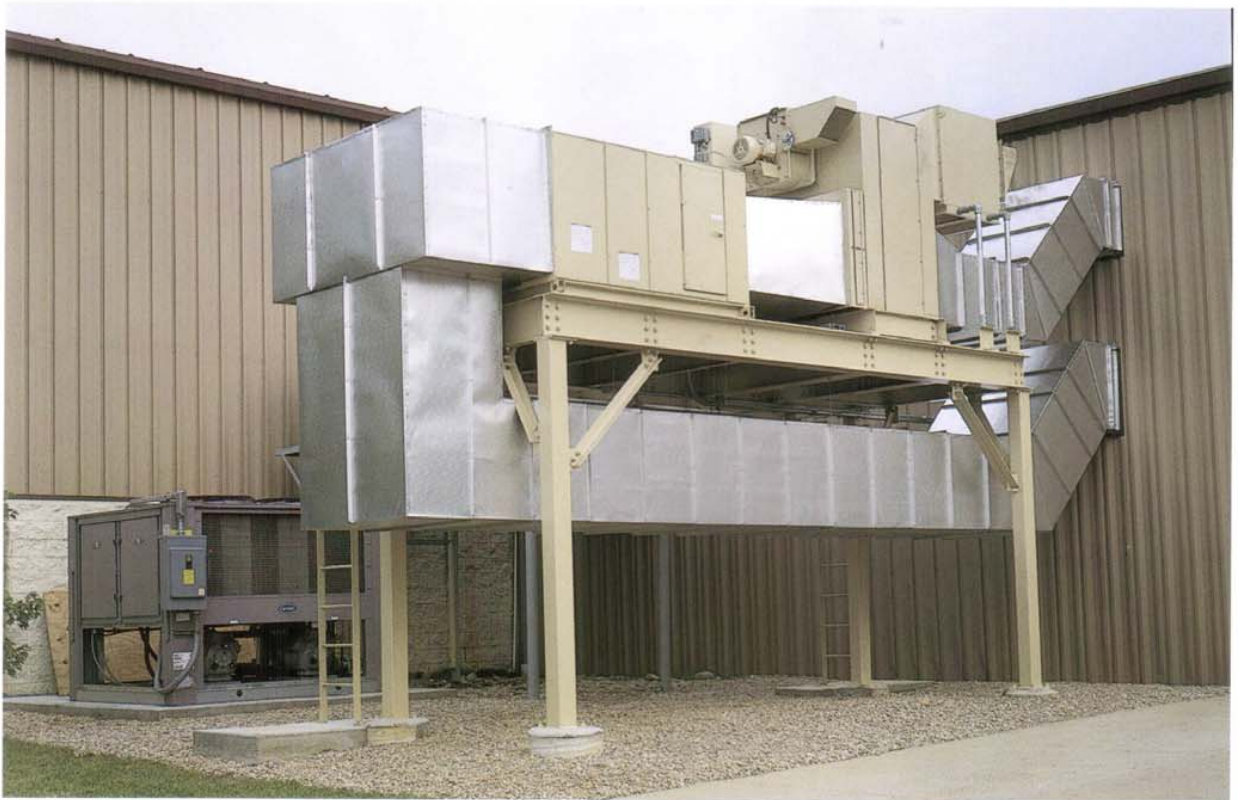
A Model THCD 8000 installed at Winn Packaging, a plastic blow-mold facility, located in Fairfield, Ohio