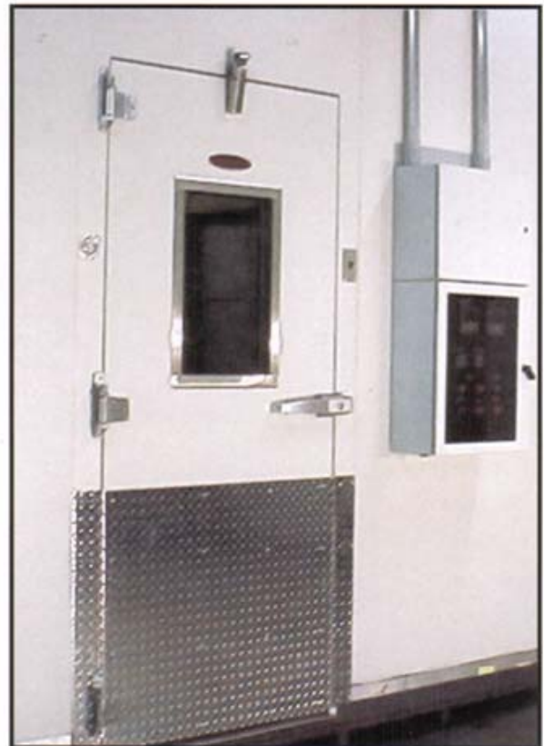
Standard accessories subject to change without notice